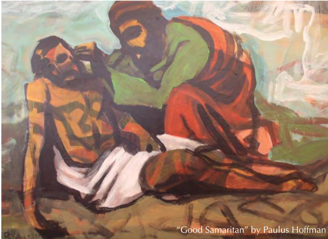
"Good Samaritan" by Paulus Hoffman