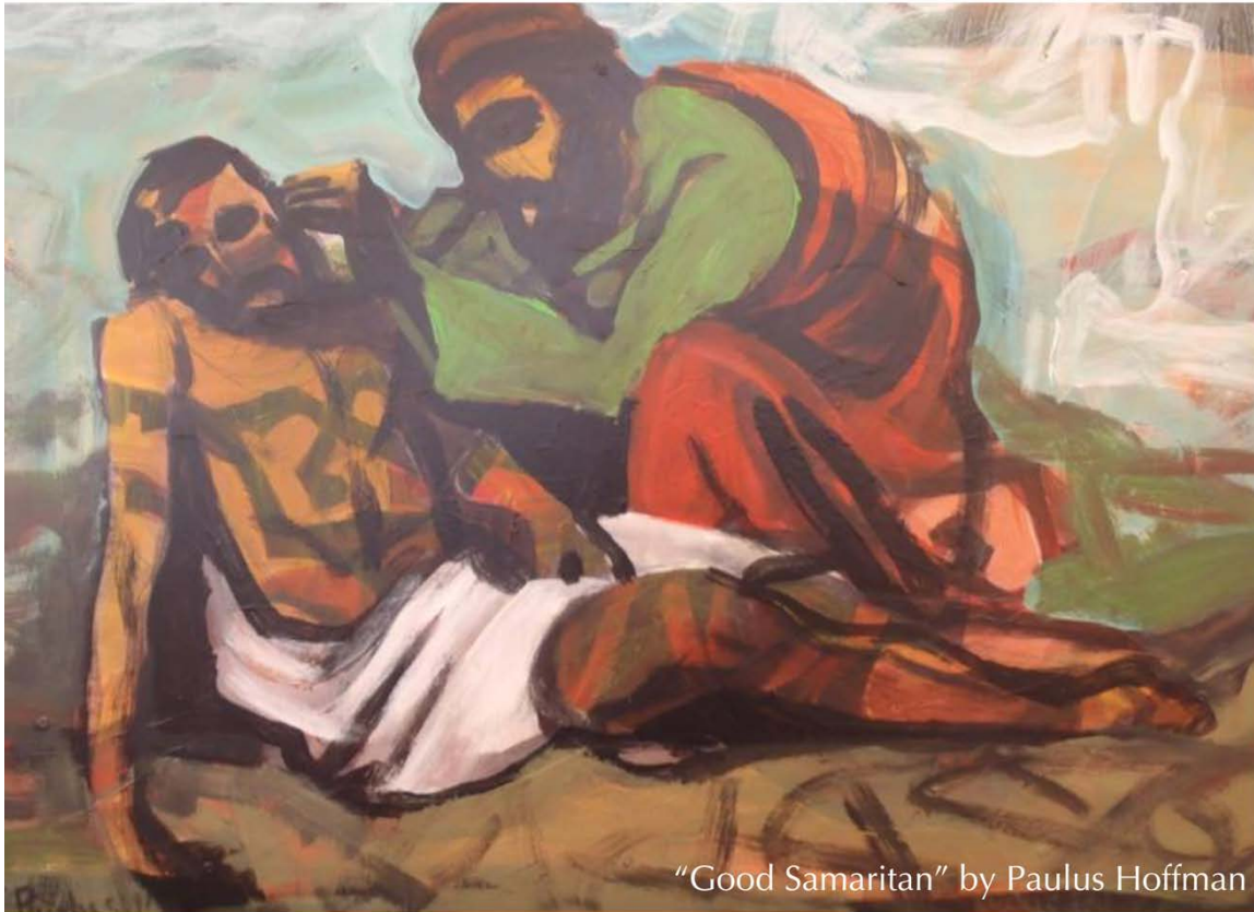
"Good Samaritan" by Paulus Hoffman