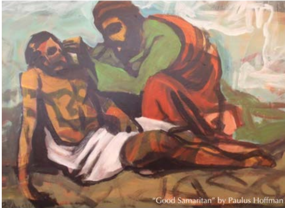
"Good Samaritan" by Paulus Hoffman

THE WORLD AS IT COULD BE SUMMER SERMONS ON THE PARABLES OF JESUS