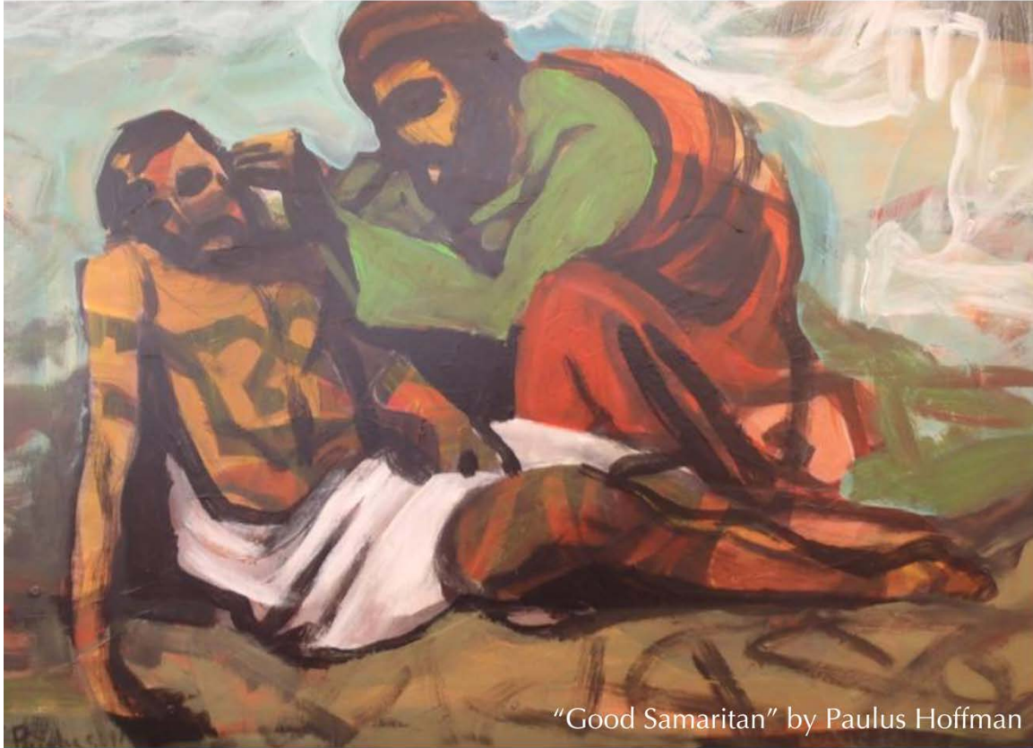
"Good Samaritan" by Paulus Hoffman