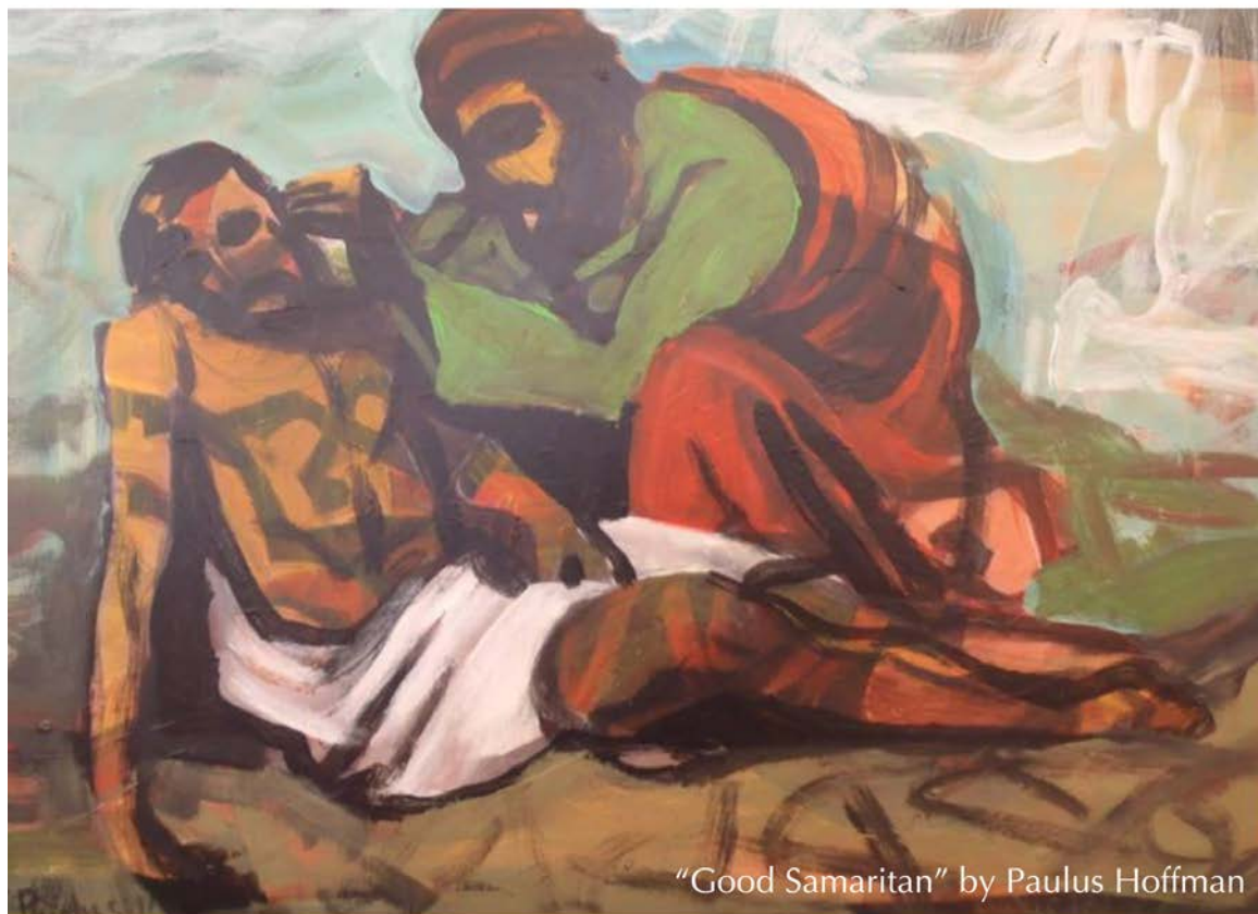
"Good Samaritan" by Paulus Hoffman