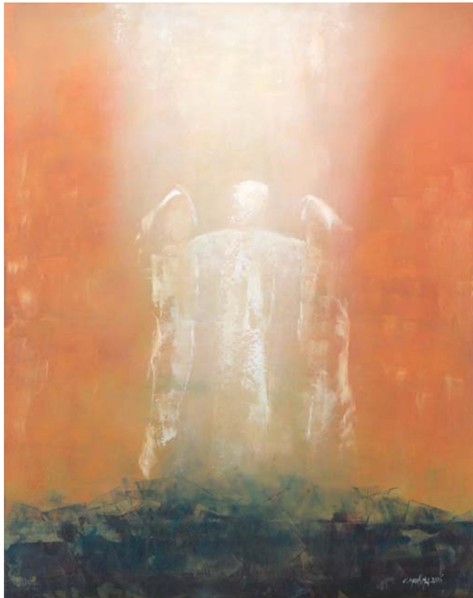
The Transfiguration by Cornelis Monsma