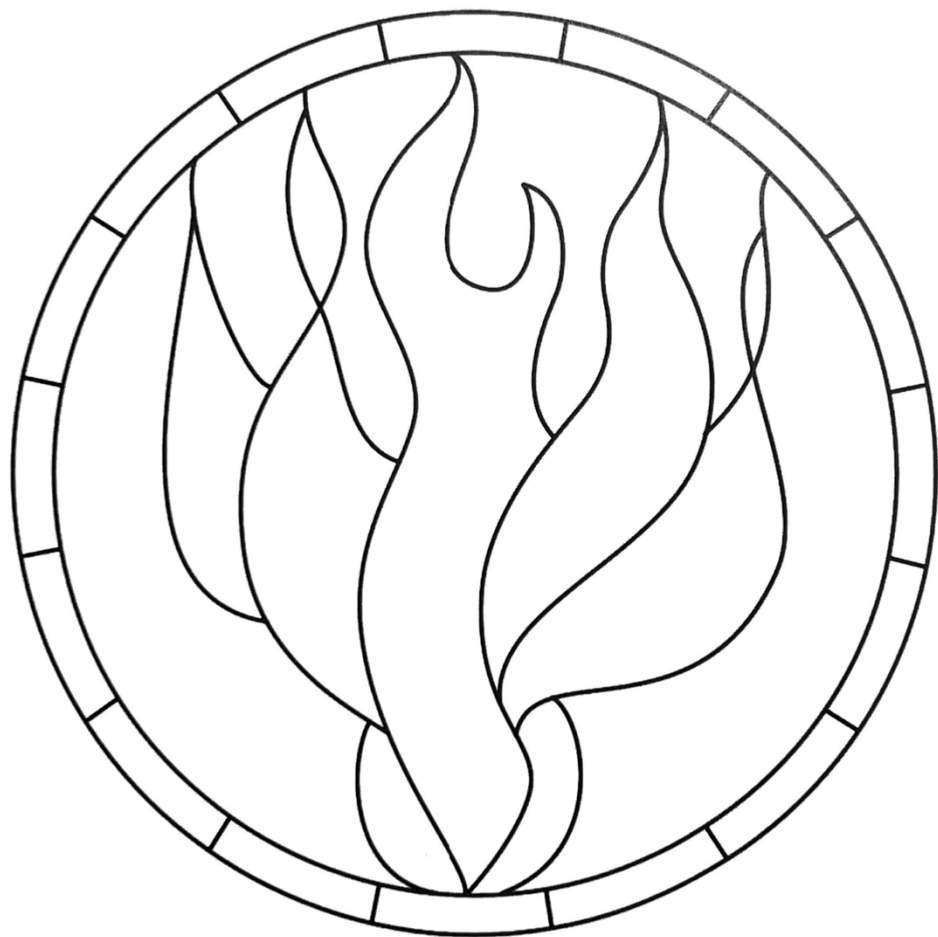
Pentecost Coloring Sheet

This image includes a dove representing the Holy Spirit's descending on Jesus at his baptism. The flame-like wings refer to the coming of the Holy Spirit at the gathering of disciples on the day of Pentecost. The circular frame symbolizes the Spirit moving throughout the world from creation to the present day.